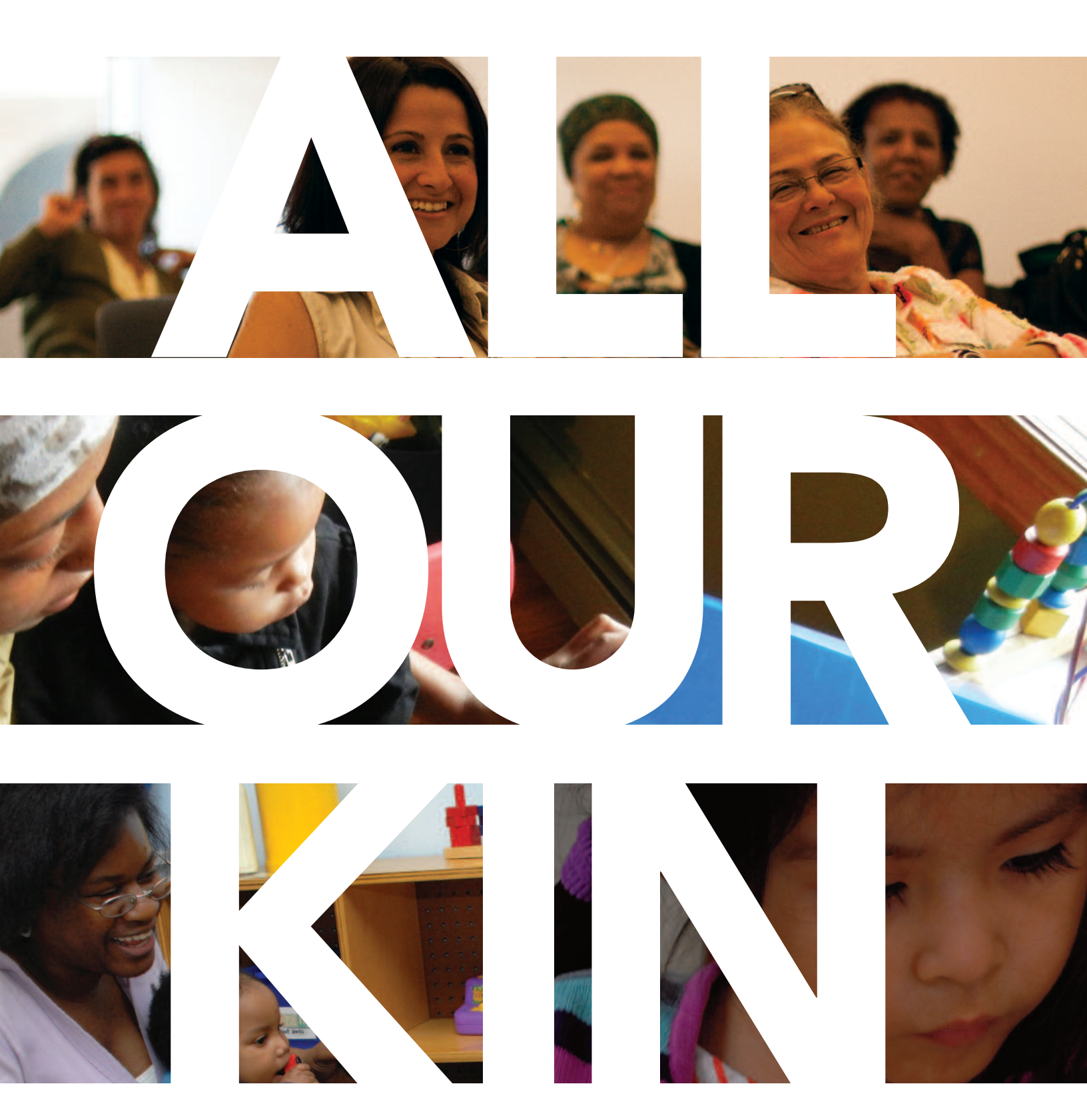
All Our Kin Annual Report 2014